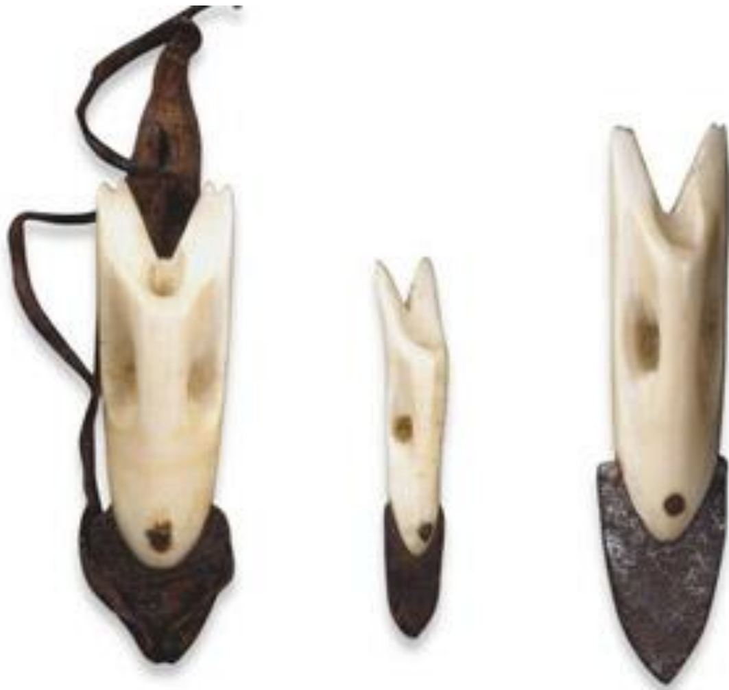
Spear heads made from walrus tusk.